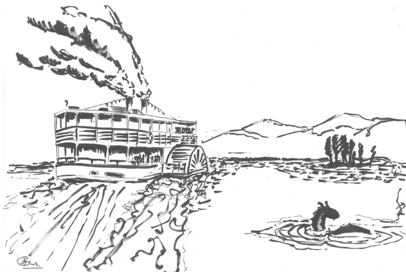
Figure 1.1. During summer 1870, the serpent was spotted by passengers of the steamship Curlew north of Crown Point, New York (Jonathan Clark sketch).

to get a better description and was seen through a field glass. 69 This incident marked the beginning of a series of close encounters that would gradually escalate into a regional panic. Soon the entire lake was on monster alert. In 1873, it came, in spectacular fashion, to the settlements on the New York side of the lake.