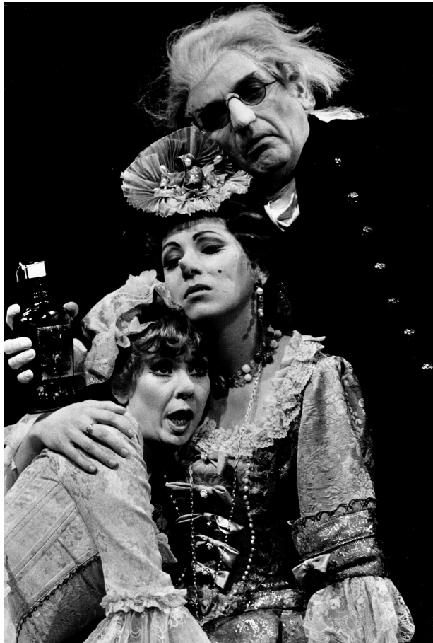
Figure 4. The Beggar's Opera : "Our Polly is a sad slut.. How not? Lack of virtue runs in her family..

The Beggar's Opera , a ballad opera (comic opera) in three acts by John Gay. Lyrics by Gay and others. Music selected by Gay and arranged by Johann Christoph Pepusch. Produced at Lincoln's Inn Fields Theatre, London, January 29, 1728.