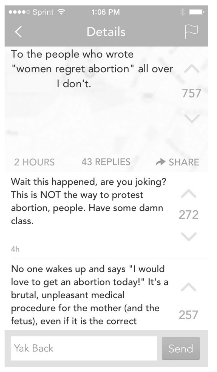
Figure I.1. Screenshot of the Yik Yak thread in which the original poster writes about not regretting her abortion.