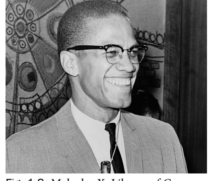
Fig. 1.8. Malcolm X. 12 March 1964.