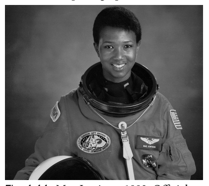
Fig. 1.11. Mae Jemison, 1992, Official NASA Photo, Endeavor. Fig. 1.12. Jeff Henderson. 8 October 2008, foodnetwork.com.