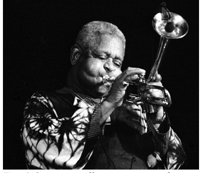
Fig. 1.6. Dizzy Gillespie. Normandie, France 20 July 1991, Roland Godefroy, photographer.

Guidance Council Reading List. Pictures: public domain or used by permission.