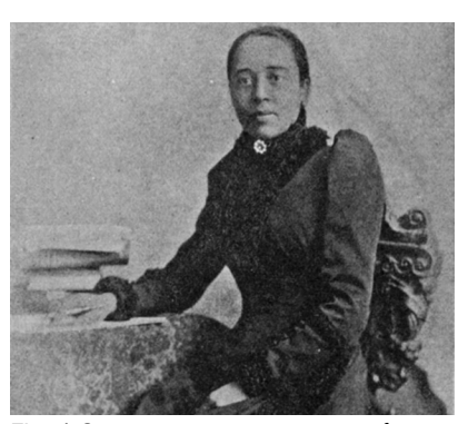
Fig. 1.3. Anna J. Cooper. A Voice from the South, 1892. Book cover.