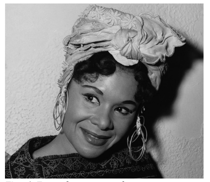
Fig. 1.5. Katherine Dunham. 25 January 1956.