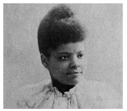
Fig. 1.1. Ida B. Wells. 1897.