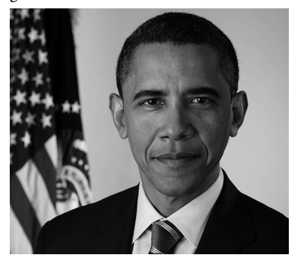
Fig. 1.10. President Barack Obama. 14 January 2009