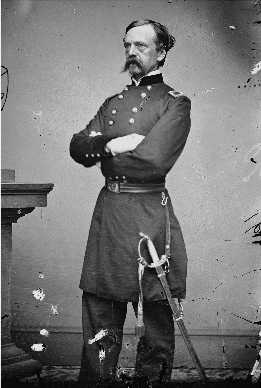
Figure I.2. BRIGADIER GENERAL DANIEL E. SICKLES. Daniel E. Sickles raised the Excelsior Brigade and eventually rose to the rank of major general with command of the entire 3rd Corps.