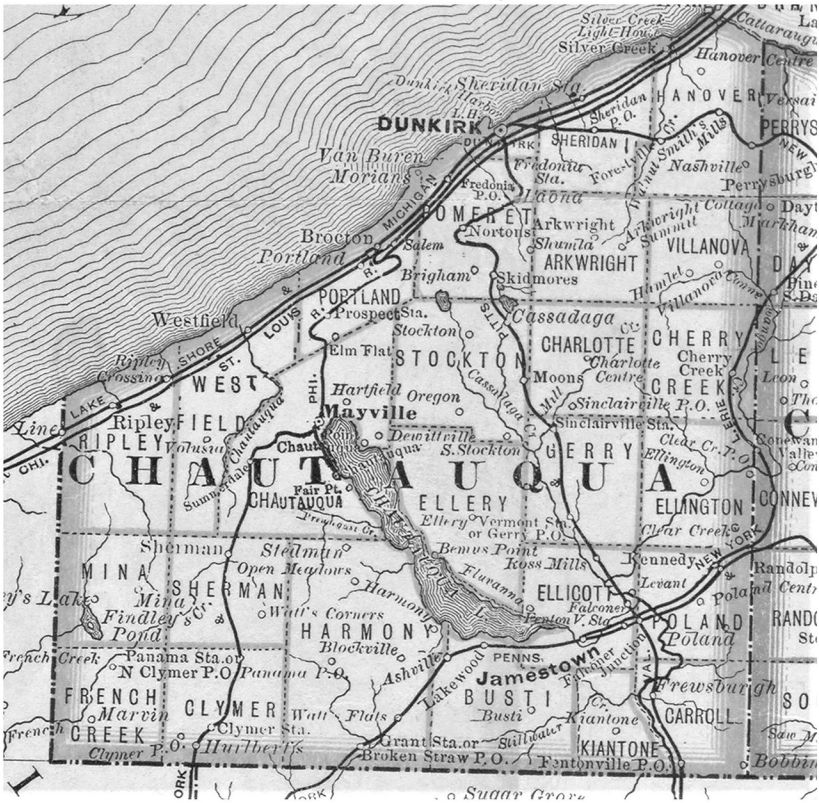
Figure I.3. MAP OF CHAUTAUQUA COUNTY. Chautauqua County is the western-most county in New York, tucked in between Pennsylvania and Lake Erie. This map from 1885 shows the various towns and villages within the county.