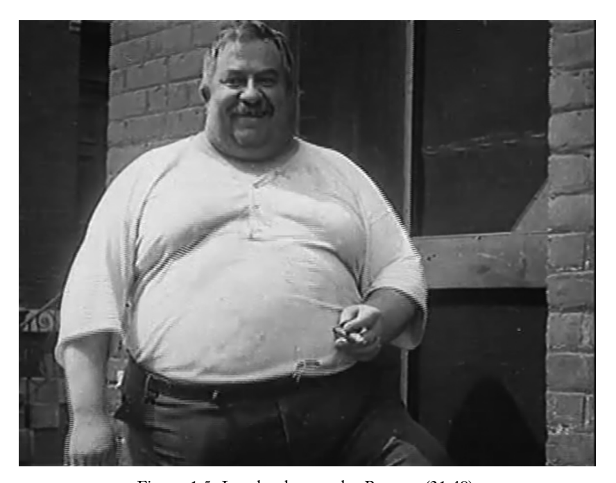
Figure 1.5. Local color on the Bowery (21:49).

in hand while Maggie and Owen trundle up the stairs and into the dark area. She shoos the kids away before pushing two, three, then four and five boys out of the dark space. Cut to the drunkards, in a complementary setting, exiting the tavern, then entering the brownstone (6:06–6:13) without interference, where more domestic violence ensues. 11 Jim tosses Owen out of the apartment and into the flight of stairs. He flees outside into daylight (08:50-09:02 and 09:06-11) in a sequence crosscut with shots of the wastrels (09:11-14) inside the apartment. Barefoot, in full daylight, he finds a place to curl up and sleep on a metal grate under the storefront of a bakery. In the implicit narrative the new life that inaugurates the next panel, also outdoors, could be a dream and a series of caricatures, even a memory-cloud, much like the local color the film discovers and records as the narrative unwinds. In one of the finest shots in the tradition of "realism" or depiction of "local color" on the Bowery, smoking a stogie, a grotesque spectator (whom Walsh or Benoit might have found while filming the sequence) enjoys either the making of the scene we are witnessing or the chaos of the world in which he lives (fig. 1.5).