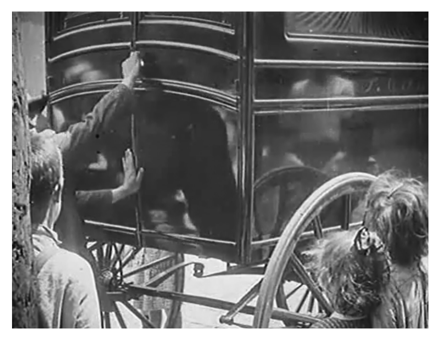
Figure 1.2. A coffin in a hearse: the filmmakers shown in their film (1:11).