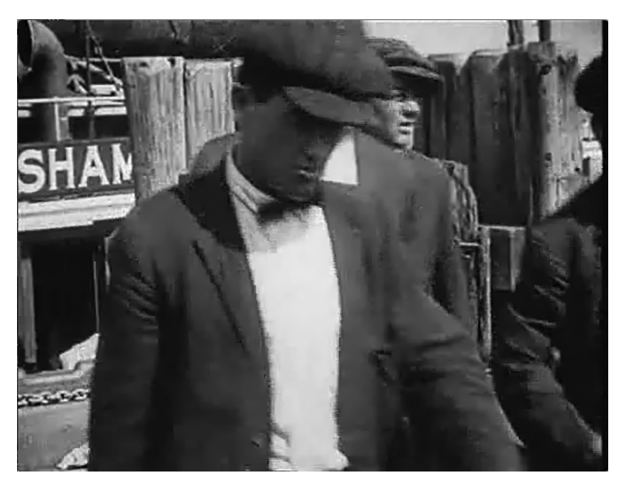
Figure 1.7. The SHAM of the Shamrock Queen (26:38).

Better known among historians, the shots recording the pyre and escape from the Shamrock Queen also oscillate between staging and verité. Walsh recalls how, after getting background takes of the Bowery and more at Fort Lee, New Jersey,