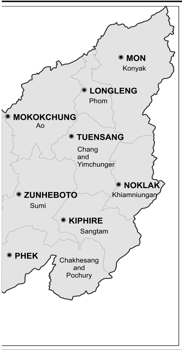
sixteen tribes of Nagaland.