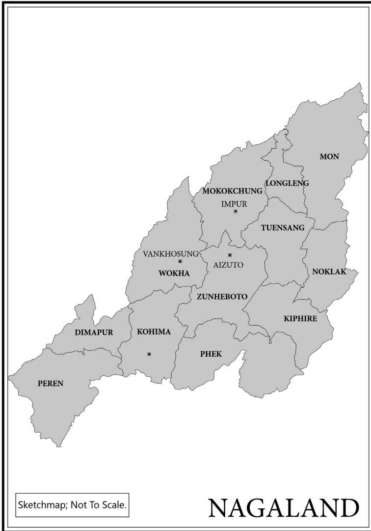
Map 1: American Baptist mission stations in the Naga areas by 1955.