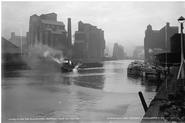
Figure 1.2. This photograph shows some of Buffalo's early wooden elevators. They stretch from the foot of Main Street along the Buffalo River. A lake boat is docked at the Eastern Elevator (the second on the left) and a tugboat in the foreground pulls a loaded canal barge along the river. The smokestacks beside the elevators show that they are steam powered. Courtesy of Library of Congress Prints and Photographs Division. LC-DIG-det-4a07180.

By 1900, a postcard picture of Buffalo harbor shows a busy grain trading port. Lake boats deliver their cargo of grain to the elevators, while tugboats pull barges loaded with grain up the Buffalo River on their way to the Erie Canal. Smokestacks rise above the plants that power the elevators, which are all built of wood in the style of Dart's original.