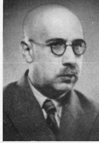
PHILIPP FRANK, Ph. D.

Professor of Theoretical Physics, German University of Prague