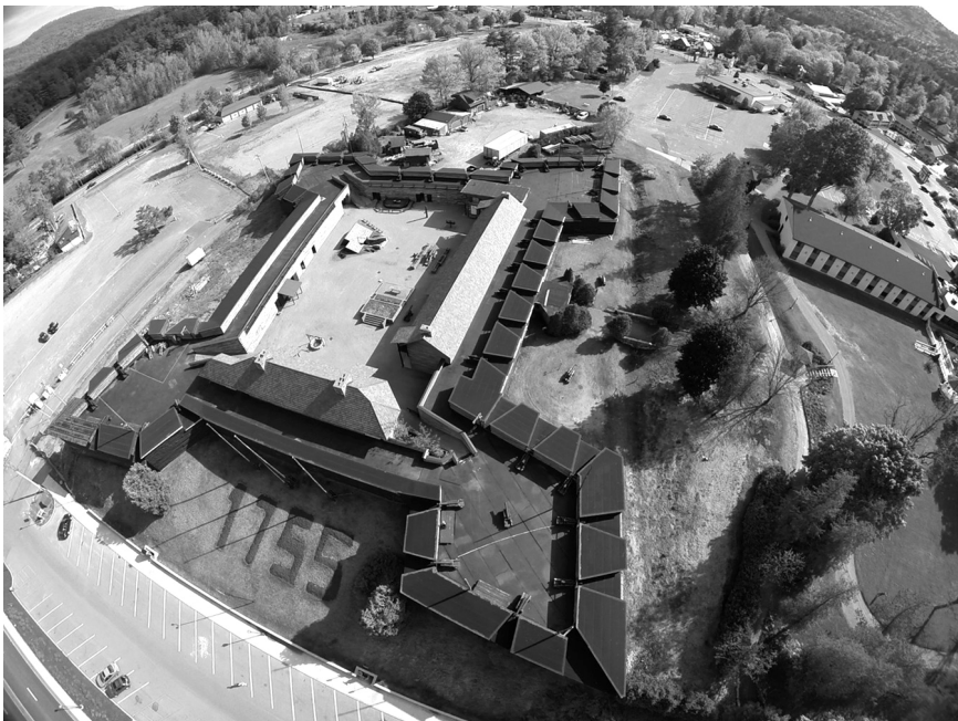
Figure 1.4 A drone shot of Fort William Henry Museum located on the south shore of Lake George, New York. The replica fortification was finished in 1954 and is a reproduction of historic Fort William Henry, a British military installation from 1755–1757.