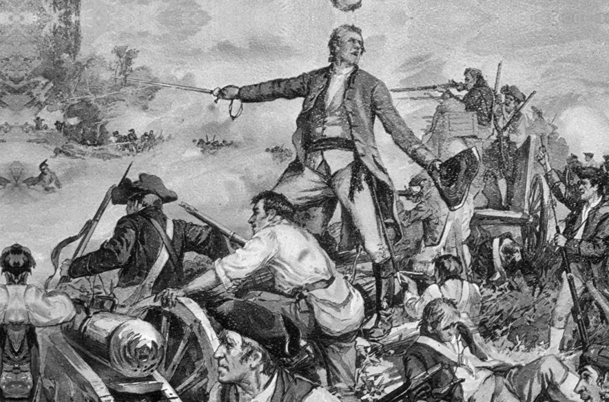
Figure 1.3 Illustration by Frederick Coffay Yohn showing British and provincial soldiers fighting the French and their Native American allies during the Battle of Lake George (September 8, 1755). Yohn's painting appeared in the 1905 Glens Falls Insurance Company calendar.