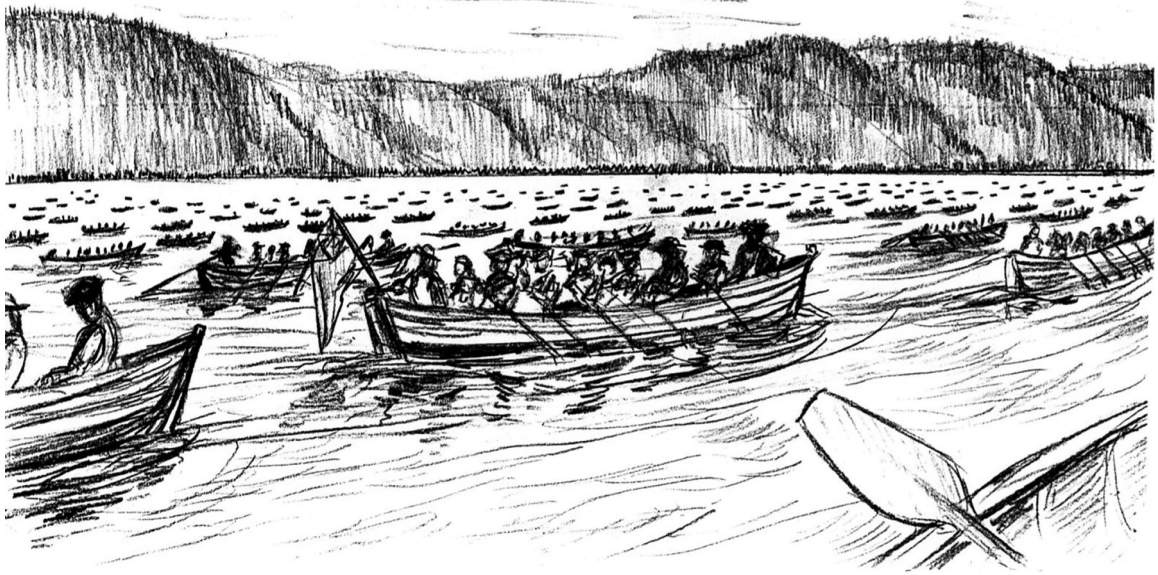
Figure 1.5 A drawing depicting bateaux and whaleboats, part of the formidable armada of British warships on Lake George during the July 1758 Abercromby campaign against the French in the Champlain Valley.

eight hundred warships traveled over Lake George using some of the very vessels that had been sunk in the lake in 1758 and raised from the bottom of Lake George in 1759. Amherst's substantial martial contingent promptly occupied the two French fortifications at the south end of Lake Champlain—Fort Carillon (later called Fort Ticonderoga) and Fort St. Frédéric (later known as Crown Point). Both fortifications had been abandoned and deliberately destroyed by the retreating French. 12