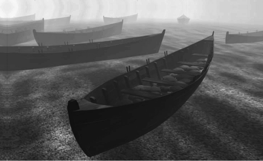
Figure 1.6 A computer-generated image depicting a cluster of submerged British bateaux with sinking rocks inside them. Some of these shipwrecks later became known as “Lake George’s sunken bateaux of 1758.”