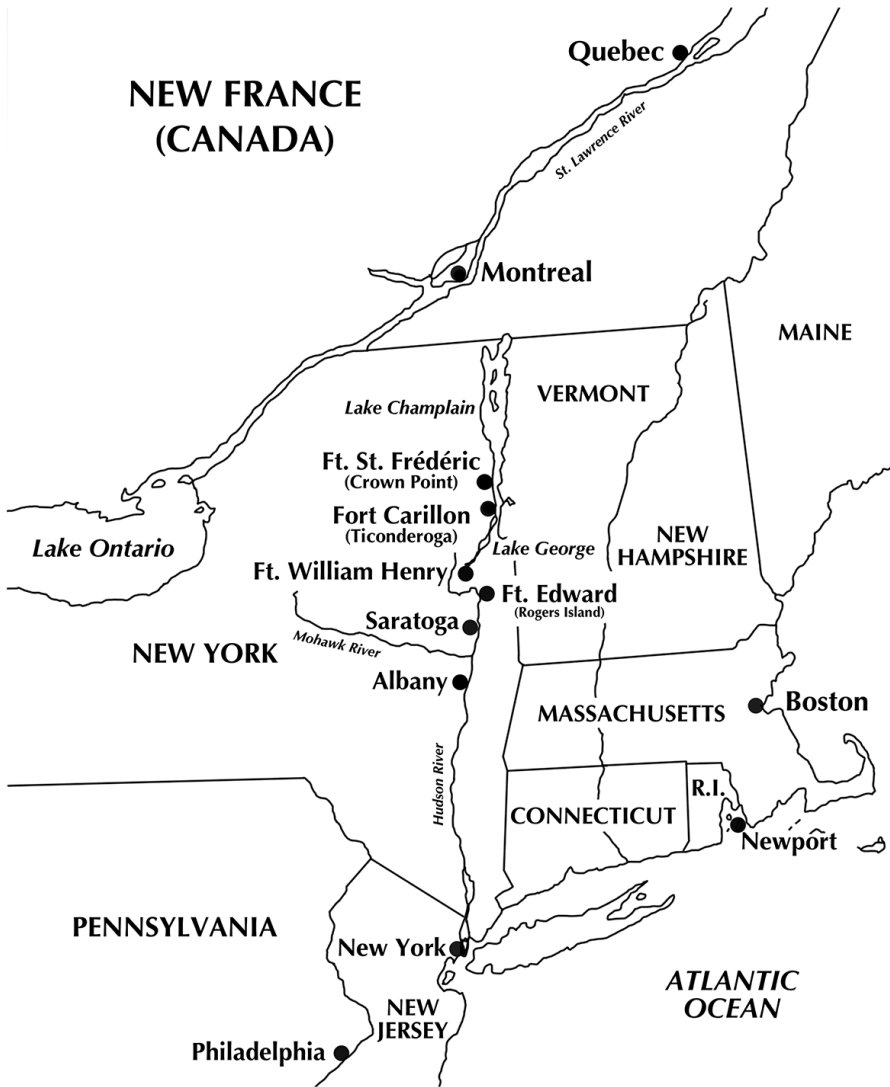
Figure 1.1 A map showing the region of the Hudson River, Lake George, and Lake Champlain corridor with some of its colonial fortification sites.