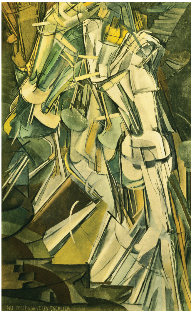
1.2 Marcel Duchamp (1887–1968), reproduction of Nude Descending a Staircase . Dated 1912. Collotype with hand additions, sheet: 13¼ × 7⅞ inches. Kay Sage Tanguy Bequest. (SC421.1974). The Museum of Modern Art, New York, New York. © 2016 Succession Marcel Duchamp/ADAGP, Paris/Artists Rights Society (ARS), New York.

What drew them was the novelty of the first show to introduce modern art, rather than the works of domestic painters, to an American audience on a large scale. In particular, cubism became a sensation, and the celebrity piece of the show emerged as Marcel Duchamp's Nude Descending a Staircase ; at times the crowd became so thick a waiting line developed just to see this one painting (fig. 1.2). Newspapers carried jokes about this art and offered prizes to anyone who could actually find anything that looked like a nude in the painting. Even the American