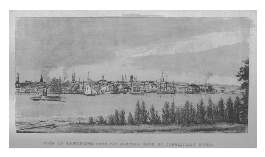
FIGURE 1.2. Hartford, 1836, Lithograph.

If he made his way east to Old Saybrook and sailed up the Connecticut River to Hartford, he would have been greeted there by a panoramic view of maritime commerce: ships coming and going and the noisy docks "smelling of molasses and Old Jamaica," the odor of the triangle trade. Steam power was coming into use, but sailing vessels still carried passengers and trade goods up the Connecticut River as far as Hartford.