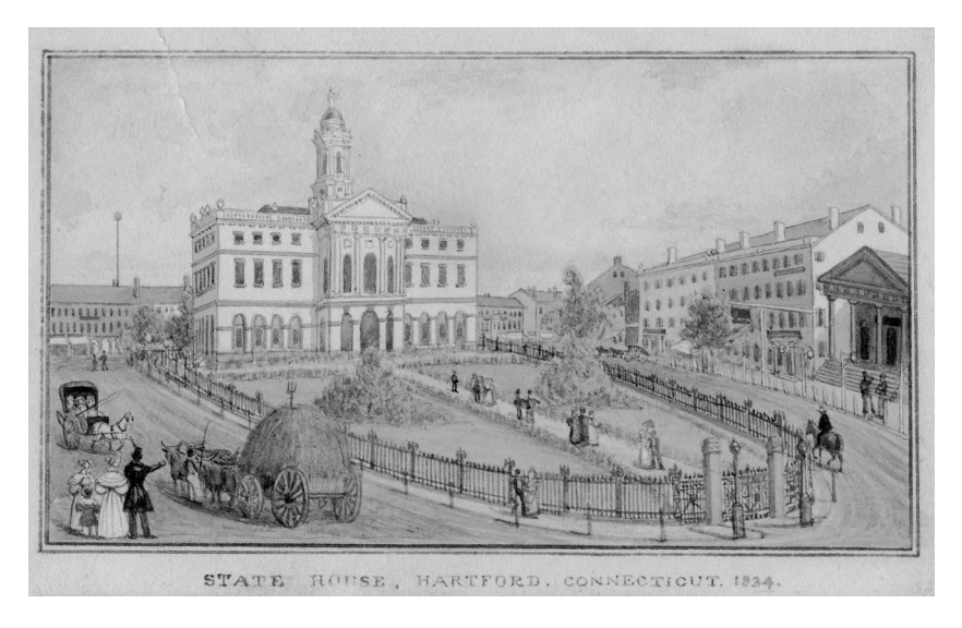
FIGURE 1.3. Hartford's Federal Style State House, 1830s.

Having spent his early years in Guilford as the son of a sailor, Holdridge would have recognized the sloops and schooners in the harbor, the scows and flatboats bringing lumber from northern ports, but the covered wooden toll bridge across the Connecticut River and the ferries that connected Hartford and East Hartford would have been new to him. Up from the docks, the city was a cluster of buildings forming a modest skyline that stretched perhaps three quarters of a mile along the river. Viewed from the deck of an incoming ship, the scene was punctuated by the steeples of two Congregational meetinghouses. If the boat docked at the foot of State Street, Holdridge would have looked up to see a Hartford landmark still in place, the Federal-style State House of 1796 designed by Boston's Charles Bulfinch.