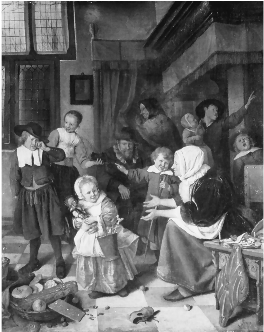
The Feast of Saint Nicholas by Jan Steen