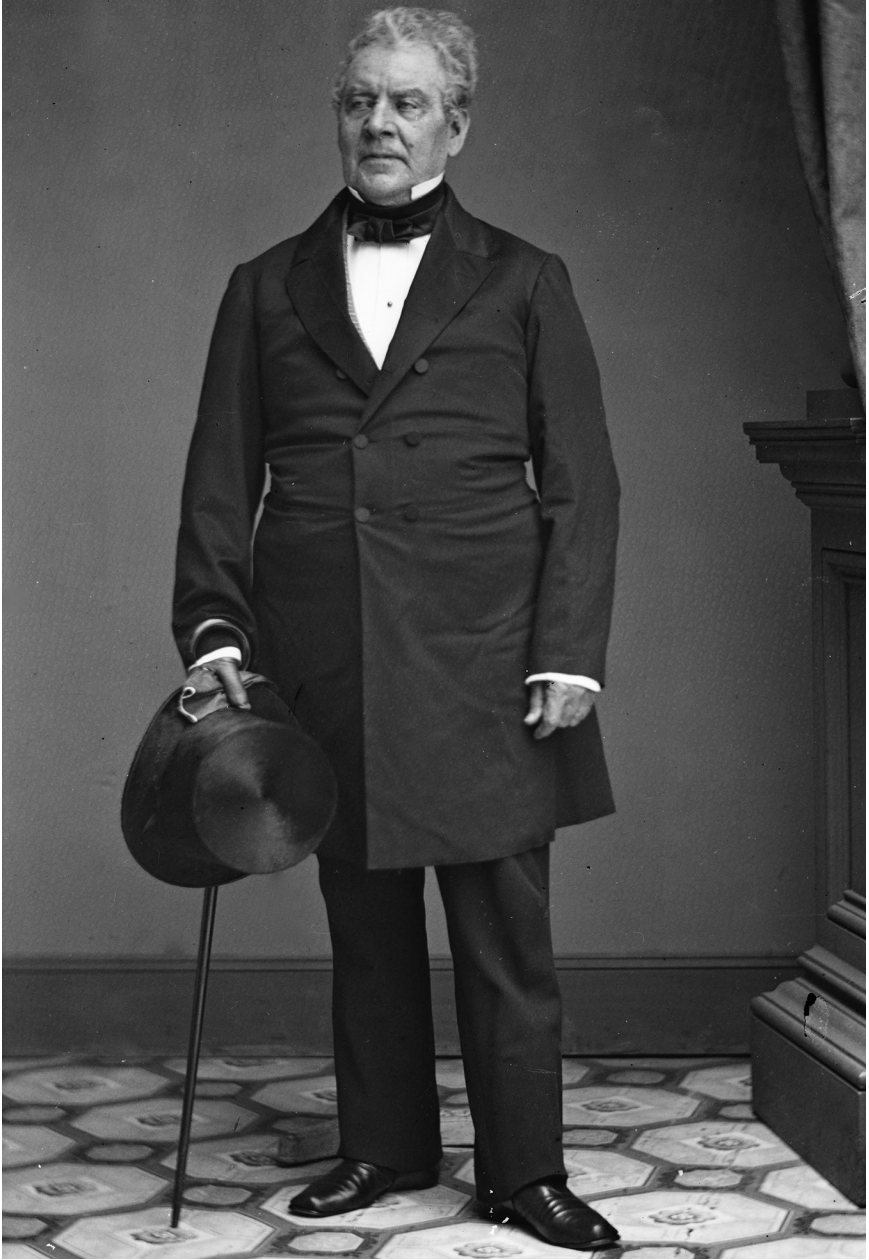
Luther Bradish.