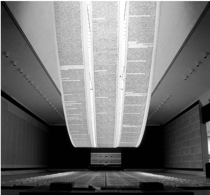
FIGURE I.1. A Book from the Sky ( Tian shu 天书), Xu Bing, 1987–1991. Above: detail of pages from two of the set of four books. Below: Installation view. (Courtesy of the artist.)