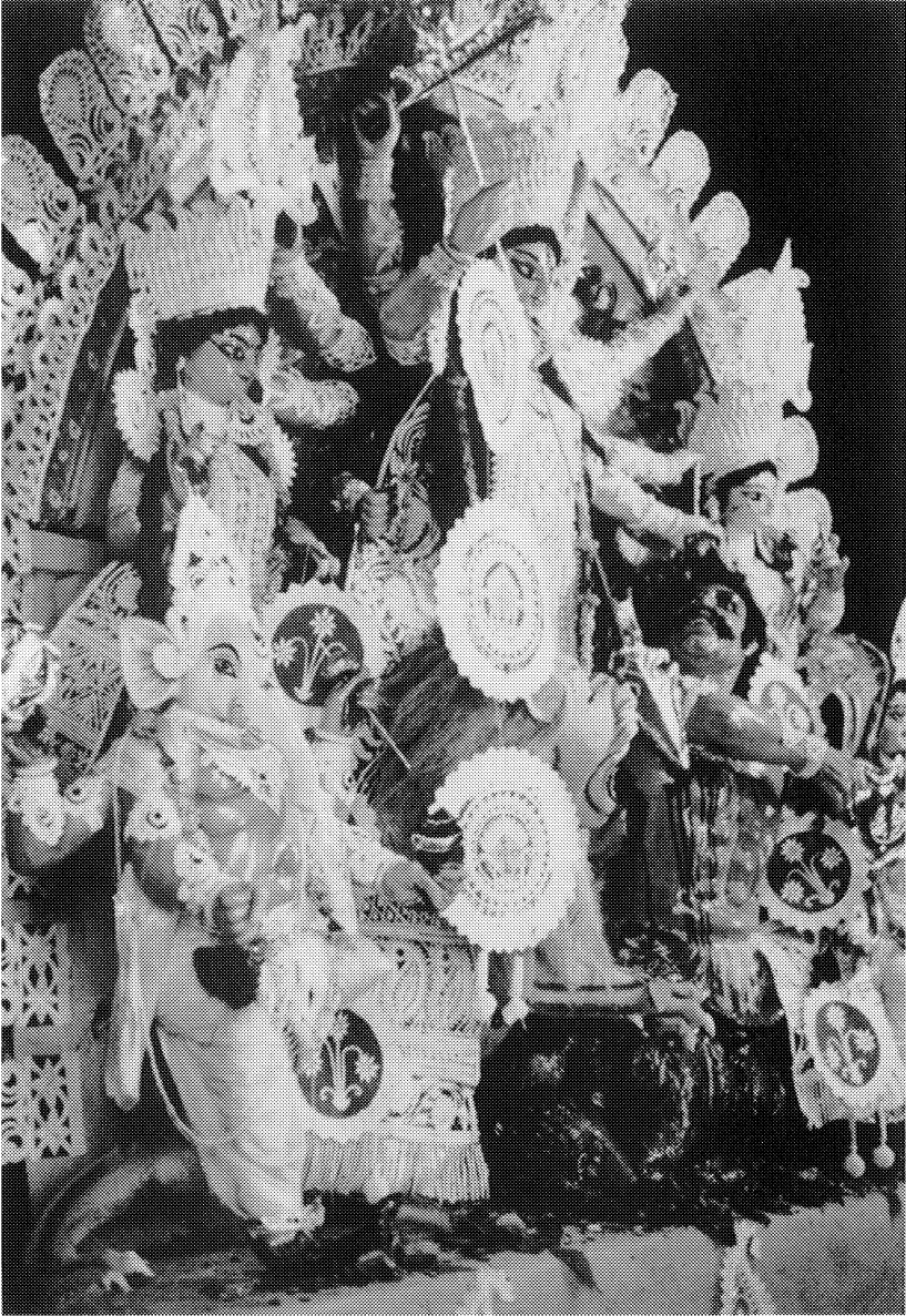
Image of Durgā at Durgā Pūjā flanked by Ganeśa, Lakṣmī, Sarasvatī, and Kārttikeya. Contemporary painted and adorned clay image, Varanasi.