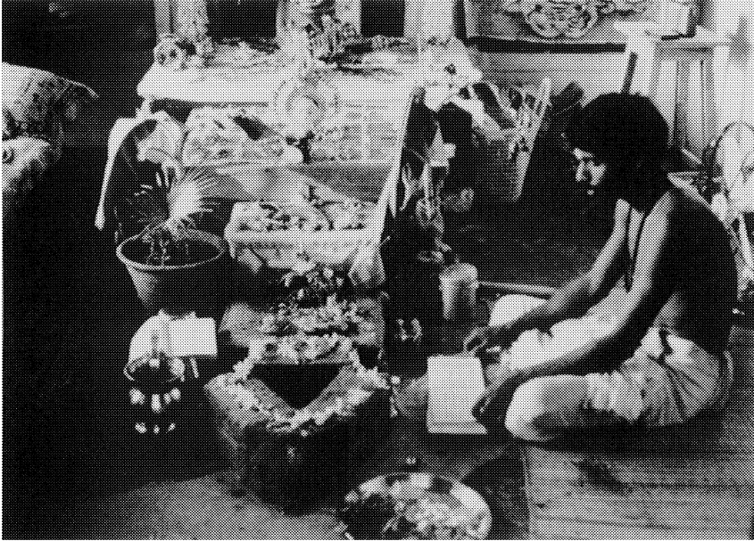
Brahmin priest performing worship of Durgā during Durgā Pūjā in Varanasi.

arrival home of the daughters is cause for great happiness and rejoicing, while their departure after the festival is over is the occasion for painful scenes of departure. Durgā herself is cast in the role of a returning daughter during her great festival, and many devotional songs are written to welcome her home or to bid her farewell. In these songs, no mention is made whatsoever of her roles as battle queen or cosmic savior. She is identified with Pārvatī, who is the wife of Śiva and the daughter of Himalaya and his wife, Mena. In this role, Durgā is said to be the mother of four divine children: Ganeśa, Kārttikeya, Sarasvatī, and Lakṣmī.