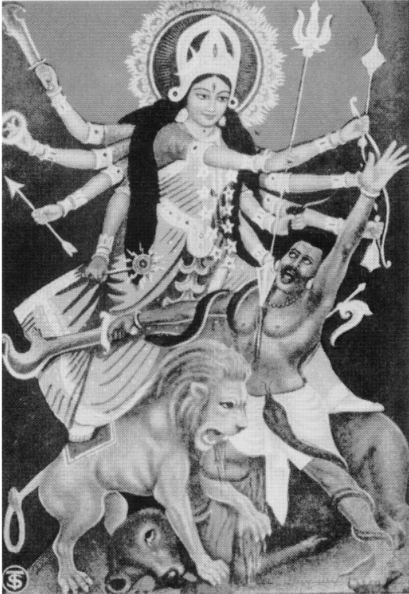
Durgā kills the buffalo demon, contemporary lithograph.