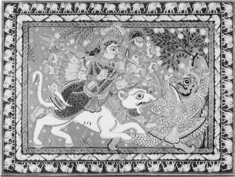
Durgā battling a demon, contemporary folk painting from Orissa.

Writing in the early nineteenth century, when the festival of Dasarā was still widely undertaken, the Abbé Dubois wrote of the celebrations in Mysore: