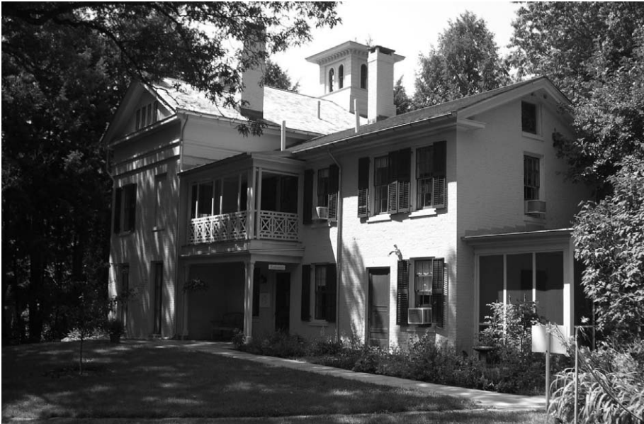
Emily Dickinson's house, Amherst, Massachusetts

Fortunately for an otherwise hopelessly puzzled posterity, she appended a note to this when she sent it to a friend: "The Humming Bird." The ruby-throated hummingbird lives in eastern North America.