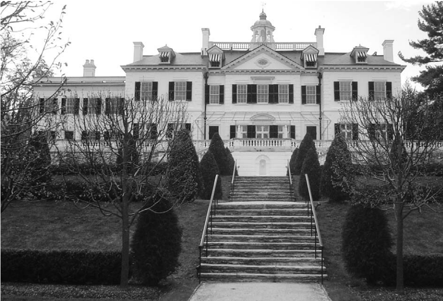
The Mount, Edith Wharton's home in Lenox, Massachusetts

Wharton divorced her husband in 1913, and thereafter spent most of her life in Paris; The Mount was her home for only ten years. Yet it was there that she wrote her two greatest works— The House of Mirth (1905), and Ethan Frome (1911). Emily Dickinson had had to break through the restrictions of mid-nineteenth-century gender roles to become a great poet. She did it by staying well under the radar and avoiding celebrity. A century later, Plath and Sexton rebelled against gender role conformity and limitation. Edith Wharton was a rebel and pioneer as well. If we except Harriet Beecher Stowe and Louisa May Alcott, and I might, she was the first great female American novelist. She had the toughness and independence to criticize her privileged world and find it crass and cruel and greedy. Her opinion of that world (and its response to that critique) partly explains her removal to Paris.