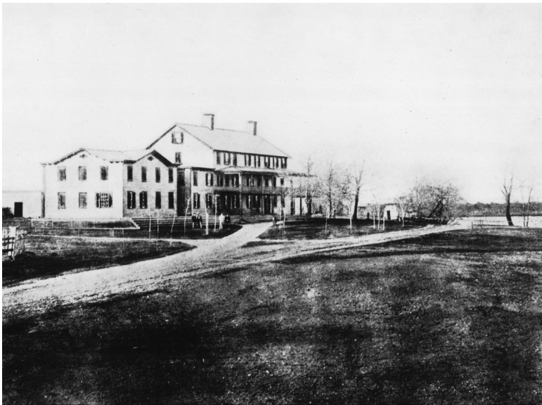
Photo 1.2. The Club House, circa 1870

Fire Island Land Uses. There are today two principal types of land use on Fire Island that are, in the main, oriented toward summer recreation: residential developments, and federal, state, county, and municipal parks. Each of these land uses provides for the common needs of different user-groups and for the different needs of individual user-groups.