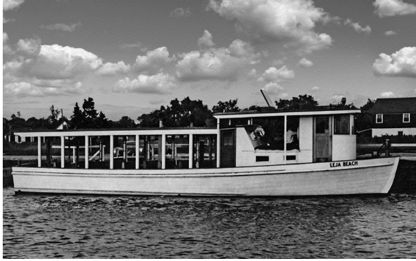
Photo 1.7. Leja Beach Ferry, 1945

community broke off from the western part, calling itself Ocean Ridge. Today, the area has 250 houses. The marina itself now has two hundred boats, and has given rise to a third segment of the population called “live aboards.” Live aboards stay on their boats for two weeks, enjoying the community’s amenities, patronizing the casino, and shopping at the sole grocery store. Davis Park has long been popular with singles and home to the “sixish,” a popular innovation in which a single residence would be randomly chosen as the site of a “bring-your-own-bottle” party. The sixish went out of style soon after parties moved outdoors “leaving a trail of collapsed decks as testimony to its success.” The presence of the Catholic Church, which holds an annual ball and a Labor Day art show, a medical facility called “Bedside Manor,” and the Davis Park Association would seem to lend enough stability to the community to make it a mature family summer colony. But the public facilities and park supplied by the Town of Brookhaven make it attractive to day-trippers and probably ensures the continuation of Davis Park and Ocean Ridge as a youth favorite. 29