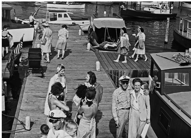
Photo 1.3. Davis Park T-Dock, 1945

designs so publicly displayed in the mostly gay enclave of Fire Island Pines lies only a short distance from the more sedate shingled, Victorian-style cottages of Point O'Woods, the island's most restrictive community. In between the extremes there is great variety: the sturdy modern designs of Saltaire, the low-keyed mix of traditional and modern architecture of Water Island, and the understated community of Fair Harbor and its close neighbor Lonelyville. In general, the architecture of Fire Island communities is not highly distinguished, mostly due to the difficulties associated with small and irregular lot sizes, restrictive zoning and building codes, and transportation to the island of building materials. The residential areas are political subdivisions of Long Island's towns of Islip and Brookhaven and the villages of Ocean Beach and Saltaire, which provide limited municipal services. 14