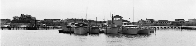
Photo 1.8. Davis Park Marina, 1952

The community considers itself family-oriented and rentals are prohibited. There is a yacht club and all activities are limited to residents. 30