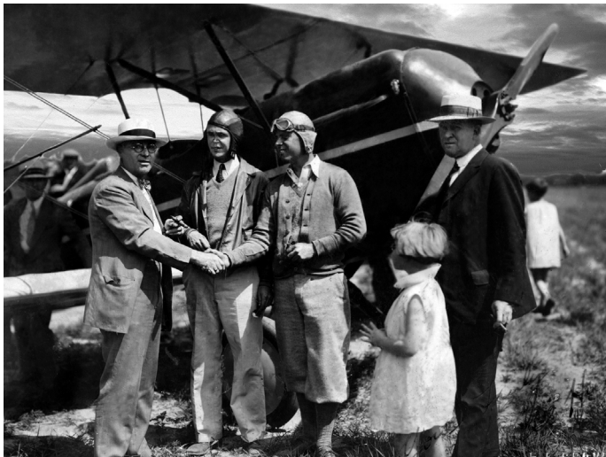
Photo 1.6. First Airmail to Fire Island, 1929