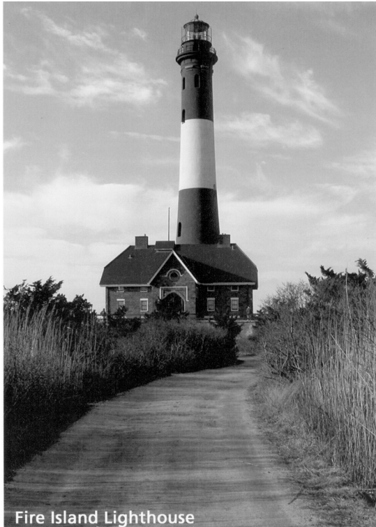
Photo 1.1. Fire Island Lighthouse

The more than four hundred ships that were reported in distress off Fire Island between 1640 and 1825 gave rise to calls for the construction of a lighthouse. In 1825, the first Fire Island lighthouse was built on land the federal government bought from the state on the edge of the Fire Island Inlet. The lighthouse cost ten thousand dollars and consisted of eighteen lamps making a complete revolution every ninety seconds. This “high tech” contraption succeeded in reducing the amount of serious wrecks, but in the summer of 1850 the bark “Elizabeth” ran aground and stirred calls for a better lighthouse. The Elizabeth wreck was a highly publicized event because among its victims was Margaret Fuller, the literary editor of the New York Tribune and early advocate of women’s rights. In 1858, a replacement lighthouse, which still stands today, was erected, slightly to the north and east of the original. This lighthouse was larger and more effective than the original, rising 166 feet above average sea level and beaming a light flash every minute. 8