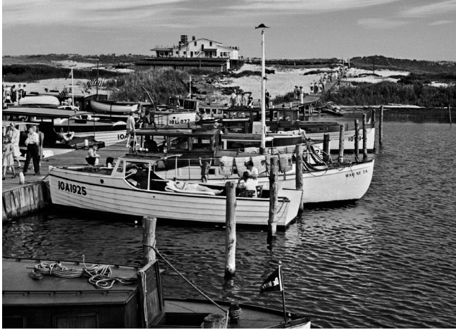
Photo 1.4. Davis Park Trustee's Walk, 1945

Point O'Woods, founded in 1894 as a religious enclave, has thrived since that time, despite having lost ten homes in a storm in 1962, and enjoys a mix of modern and Victorian architecture. Today the community maintains a level of exclusivity by fencing its border to Ocean Bay Park (the "Fence") and maintains a family-oriented flair. A private ferry services this community which sports grand, shingled, beach houses. Point O'Woods over the years has managed to maintain the old world charm of a private and cozy beach community. It is a predominantly Protestant Club that is determinedly family-oriented, and it prohibits the sale of alcohol, a legacy of its origins in Chautauqua. 16