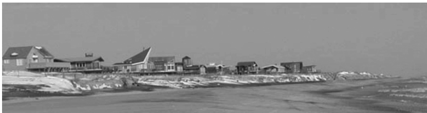
Photo 1.9. Summer homes on Fire Island, 2003

William Tangier Smith retained title to large sections until ownership passed to the Fire Island National Seashore in 1964. No established communities ever materialized on the eastern end of the island and when the U.S. government acted to nationalize the beach it was already mainly in public hands. Suffolk County and the Town of Brookhaven came into a sizable portion of the land through a series of land transfers beginning in the early 1700s made by the William Smith family for reasons that remain murky. Other portions of the eastern end of Fire Island were inhabited by squatters, as ownership became harder to prove as time wore on. The beach on the east end was mostly marshland and not attractive to builders. Shoals at the eastern end of the Great South Bay and those in Moriches Bay made access to the island difficult. Commercial bird hunters used the land in the fall until forbidden by law. The island's hay was particularly valued.