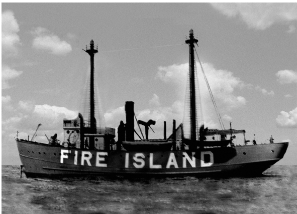
Photo 1.5. Fire Island Lightship, 1932

Point O'Woods, founded in 1894 as a religious enclave, has thrived since that time, despite having lost ten homes in a storm in 1962, and enjoys a mix of modern and Victorian architecture. Today the community maintains a level of exclusivity by fencing its border to Ocean Bay Park (the "Fence") and maintains a family-oriented flair. A private ferry services this community which sports grand, shingled, beach houses. Point O'Woods over the years has managed to maintain the old world charm of a private and cozy beach community. It is a predominantly Protestant Club that is determinedly family-oriented, and it prohibits the sale of alcohol, a legacy of its origins in Chautauqua. 16