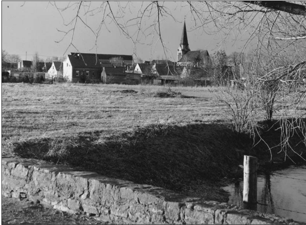
FIGURE 1.2. A village near Bernburg.