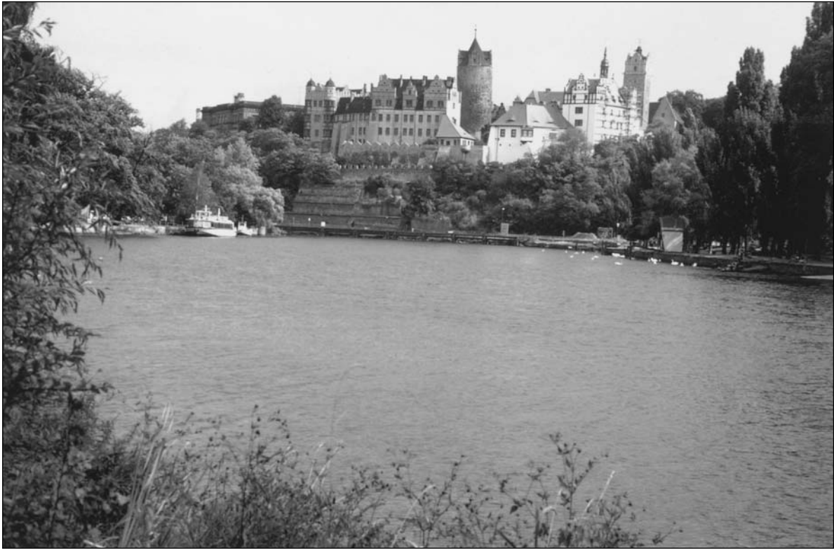
FIGURE 1.1. The Castle of Bernburg.