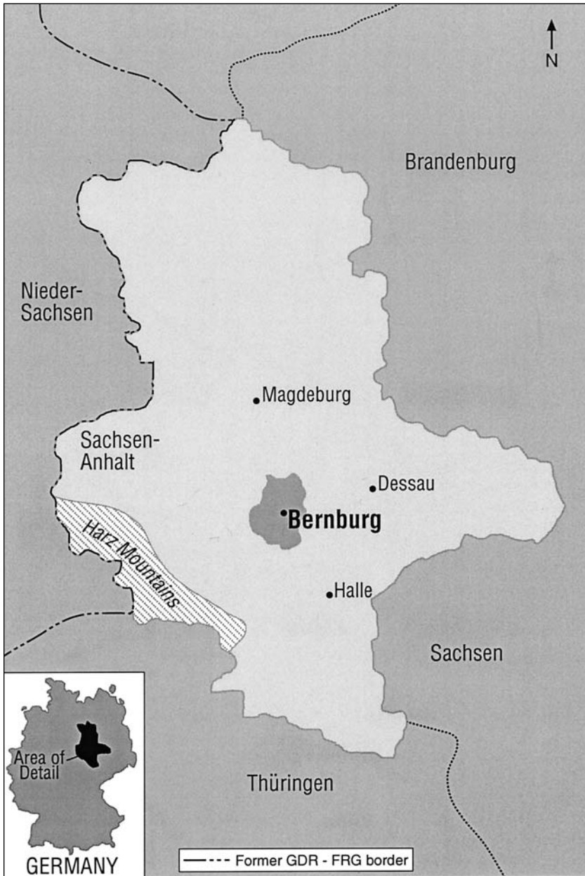
MAP 1.1. The Federal State of Sachsen-Anhalt and the Kreis of Bernburg.