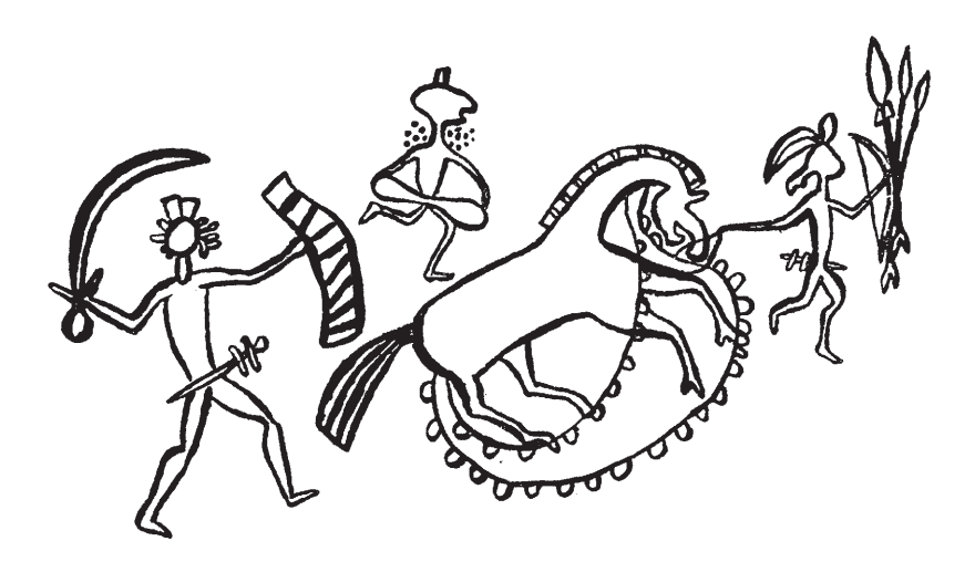
Figure 2.1. Prehistoric rock drawings: Bhīmbhetka (Maharashtra)

so, then the knowledge ("Veda") on which the construction of Harappa and Mohenjo Daro is based cannot be later than that civilization itself. ^{13}