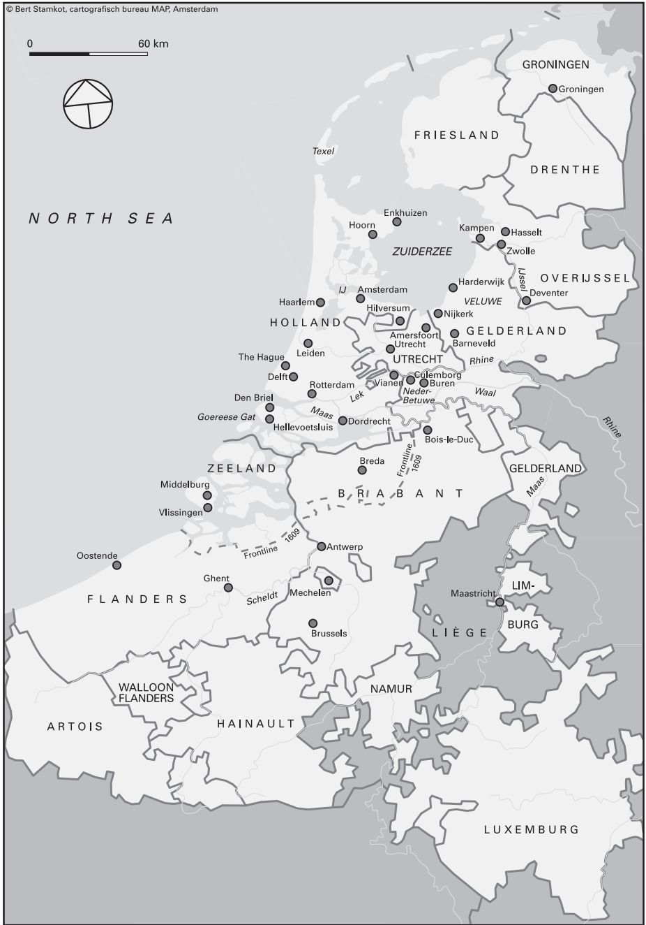
The Northern and Southern Netherlands in 1609.