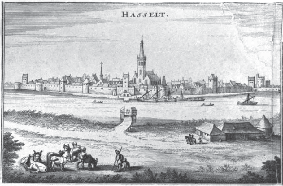
View of the town, published by Merian in 1655. Stedelijk Museum Zwolle.

in town almost continuously. In 1585 States troops were succeeded by English troops, which in 1587 were relieved by another States garrison. In 1590 Frisian troops were encamped in Hasselt, but following a visit by Maurits they were relieved by States troops in 1593. Billeting of the soldiers weighed heavily on the inhabitants, who had to face the uncertainties, insecurities and burdens of the war against the Spanish king under the leadership of an unreliable magistracy.