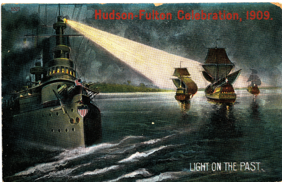
FIGURE I.1. “Light on the Past,” postcard from the 1909 Hudson-Fulton Celebration. New York: A. C. Bosseman & Co., c. 1909. New York State Library Postcard Collection QC16510.

WE MAY CALL ENGLAND OUR “MOTHER COUNTRY,” but our culture, political system, and jurisprudence have a more varied heritage. Each state with its own settlement history has a unique flavor. Our nation’s lineage, and New York’s in particular, has an often-overlooked Dutch component. Scholars differ as to how much of New Netherland, or Dutch New York, survived in present-day institutions. Some commentators say that the heterogeneous, commerce-oriented