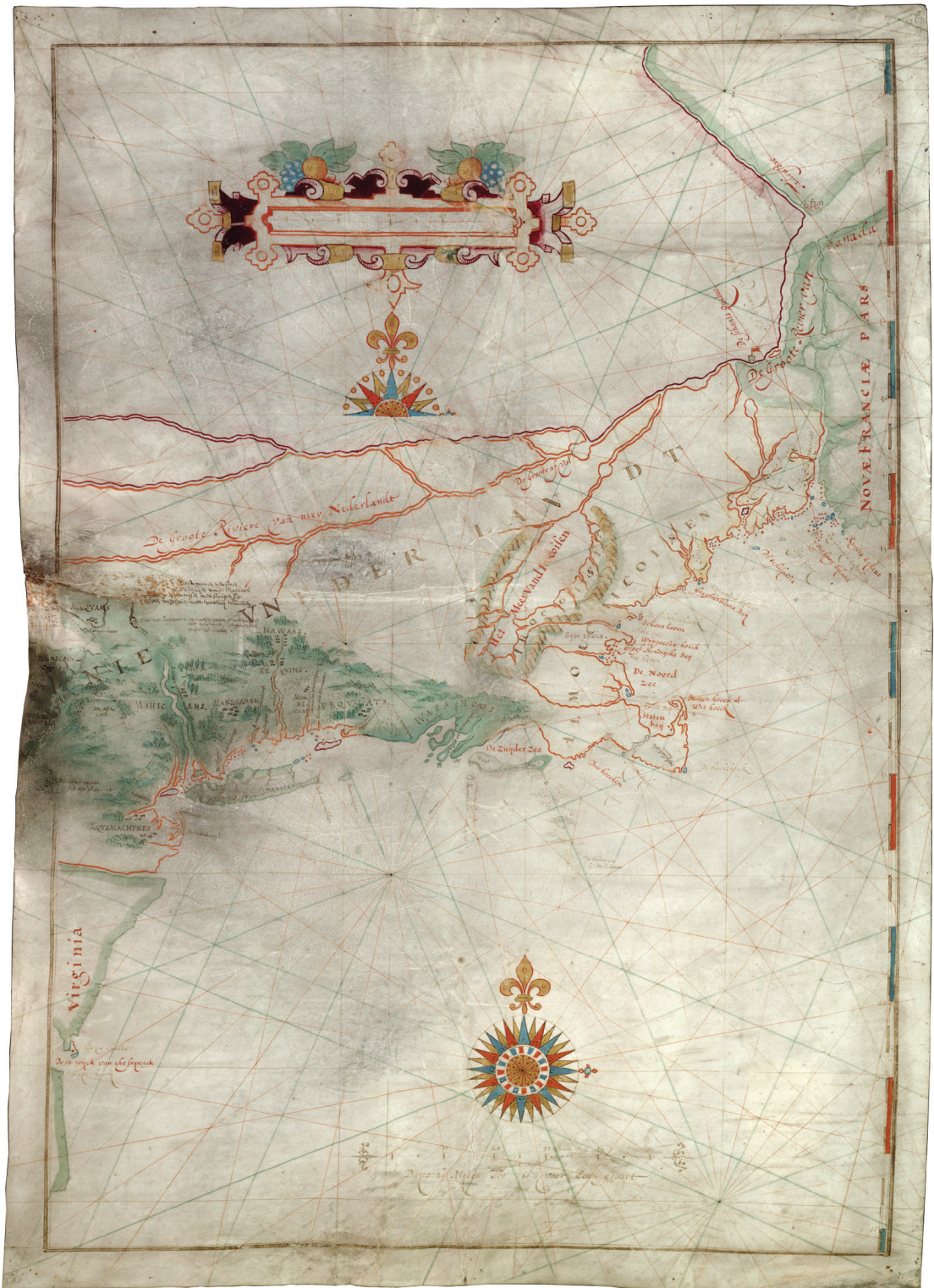
FIGURE 1.3. Figurative Map, by Adriaen Block, the first European to circumnavigate Manhattan and Long Island. Parchment, 1614. Collection Nationaal Archief (National Archives of the Netherlands) 4.VELH 520.