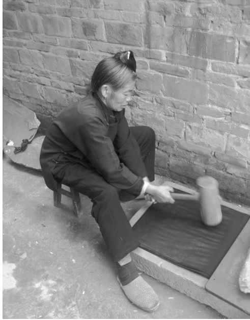
FIGURE 1.4. An elderly woman beating a stack of cloth to even out the indigo dye.