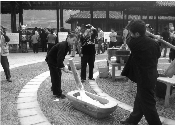
FIGURE 1.5. Villagers beating glutinous rice in a wooden basin to make a local dessert baba .