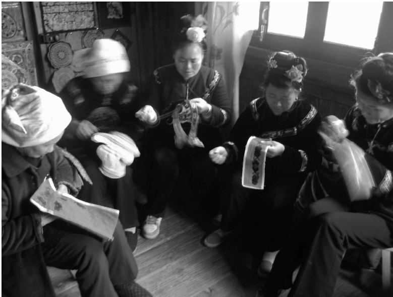
FIGURE 1.3. Miao women gathered to embroider elaborate patterns on colorful cloth.

Indeed, first-time travelers in Qiandongnan may find their experience colored by a variety of labels—“rugged,” “exotic,” “primitive”—that are associated with classic “out-of-the-way” places (Tsing 1993). Traveling in this region can be a highly unpredictable event, depending on weather, road conditions, and erratic bus schedules. Surrounded by a serene atmosphere, the Miao and Dong villages often exhibit a sense of timelessness to the tourists’ gaze: women sitting on narrow calf-high wooden benches doing embroidery, old men lounging on a roofed bridge smoking pipes to kill time, women beating indigo-dyed cloth with a wooden hammer to even out the color, steaming glutinous rice being beaten with long wooden hammers into fragrant baba (粑粑) (see figures 1.3, 1.4, and 1.5). Yet, while urban tourists bounce on the broken seats inside the packed bus along the potholed mountain roads, they are also overwhelmed by the bright, raucous, and pulsating world of everyday life: sensational music videos blaring from the mounted TV in the bus; printed advertisements on seatbacks for spas, massage salons, and nightclubs; satellite dishes sprouting on rooftops; ubiquitous mobile phones on the hands of young and old. As the multi-strand narratives and consumption ethos seep into daily life, a vision of Qiandongnan as bucolic, pristine, and unchanging is no longer (if ever) an accurate depiction.